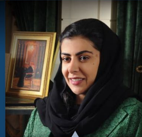
SAMA FAISAL AL SAUD