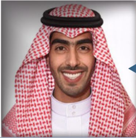
SALMAN FAISAL AL SAUD